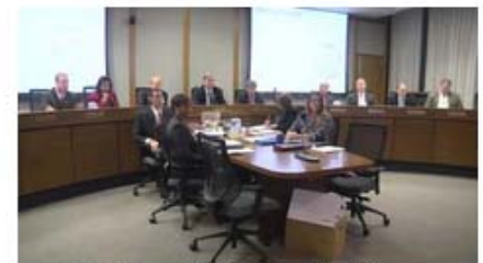
Joint Commission on Healthcare

The online psychiatric bed registry launched this March and was intended to help community service boards see current placement options for people in crisis. According to Virginia Health Information's annual report, in August facilities on average updated the system nearly three times a day. The goal is for facilities to update every time there's a bed change, and at least daily.